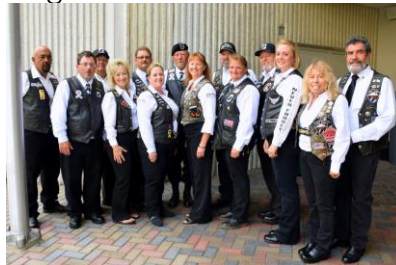
Sergeant at Arms team