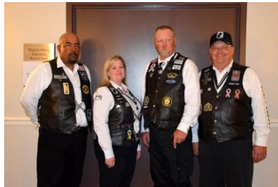
Executive Officers from Idaho & Nevada